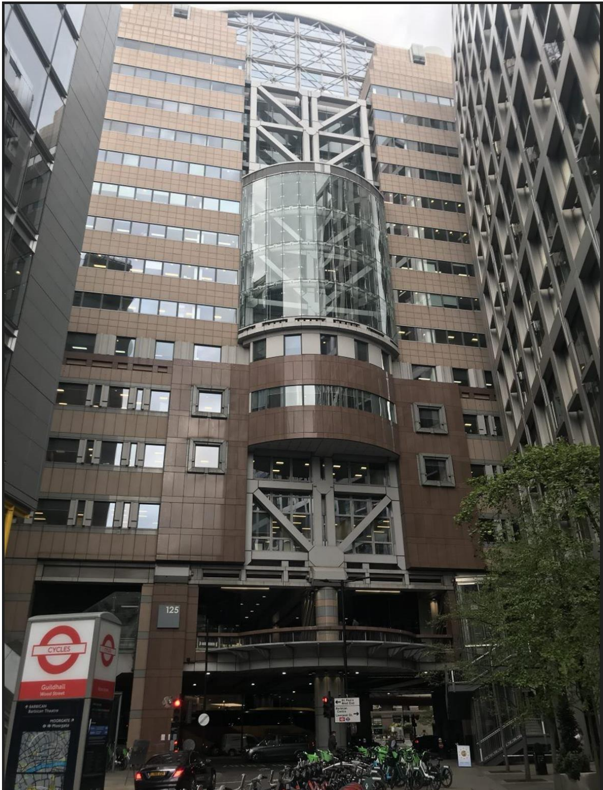
125 London Wall, Wood Street South Side Looking North