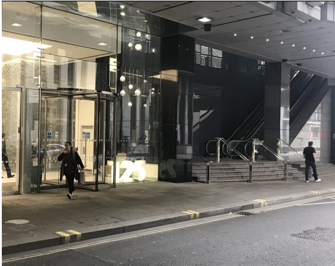
Wood Street North Side, 125 London Wall Reception Entrance