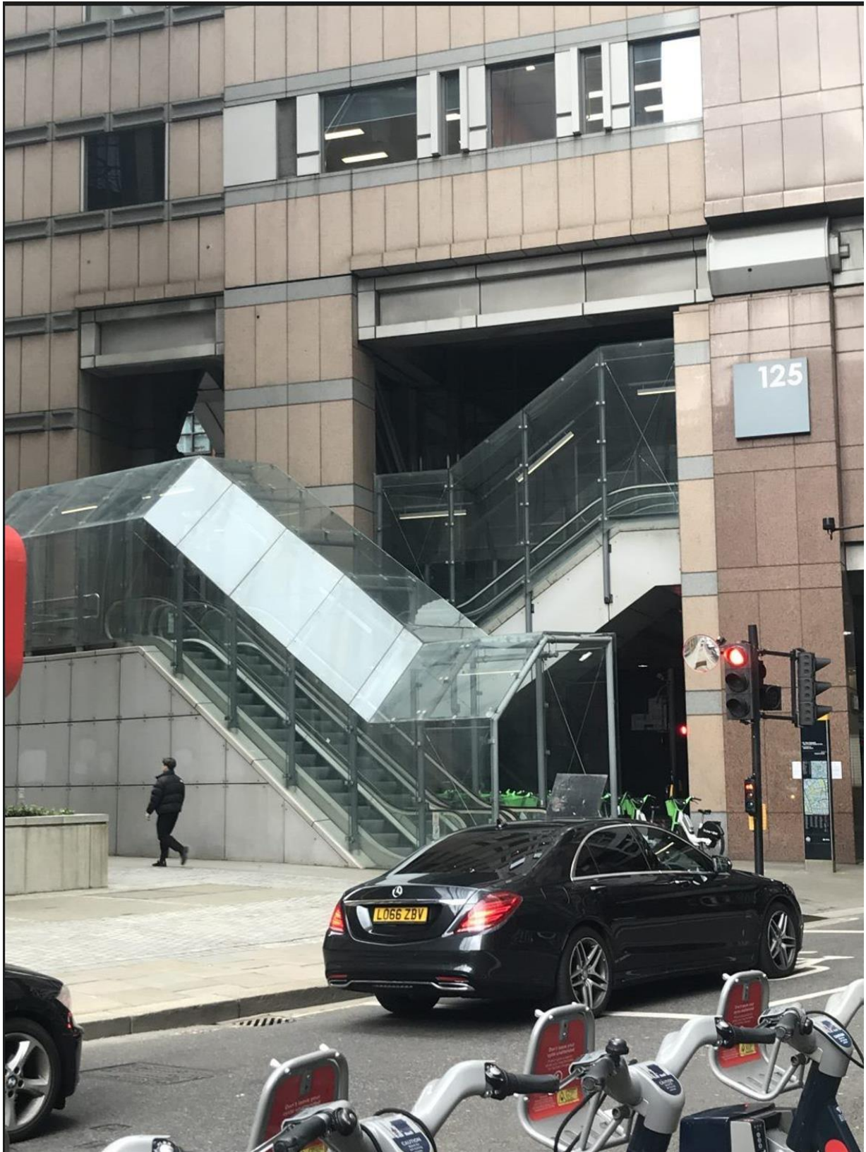
Escalators Wood Street South Side